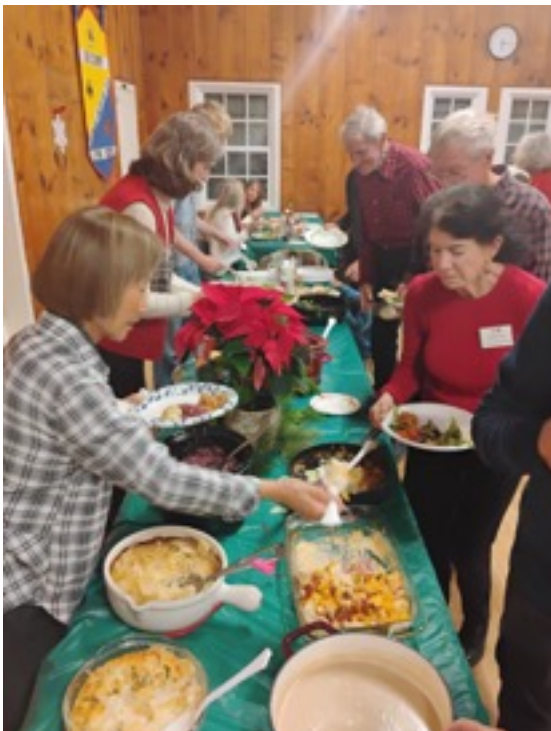
Christmas Dinner chow line in 2025.