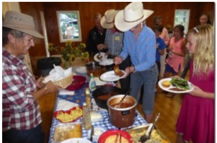
"Western Night" i.e., the chili cook-off, chow line in 2018. Note the similarities.