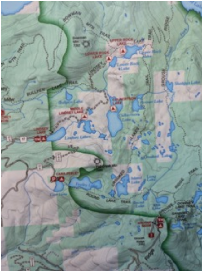
The Map. Follow the dotted line.