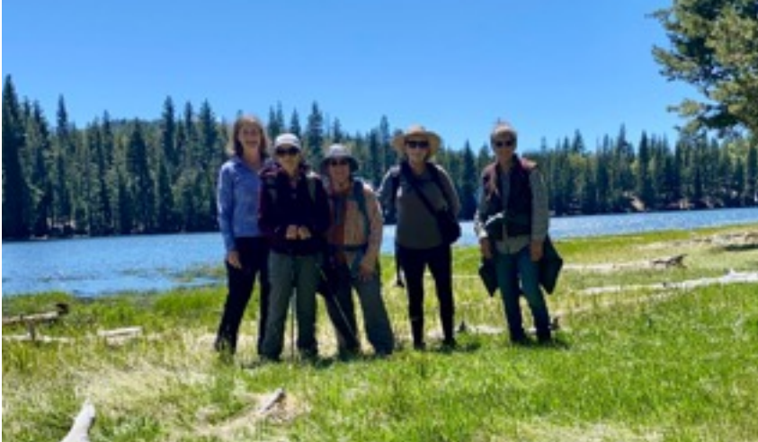
Happy Wanderers at Rucker Lake on May 22, 2025.