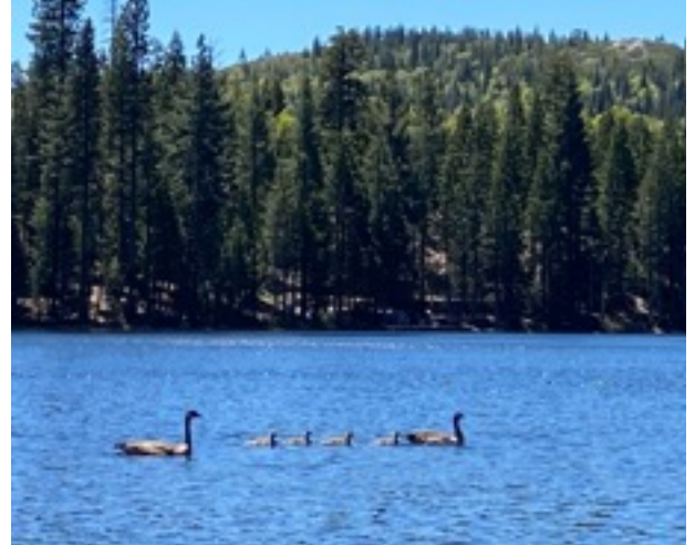
Happy geese on Rucker Lake on May 22, 2025.