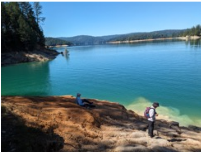
Bullards Bar Reservoir -- Just look at all that beautiful WATER!

Ten intrepid hikers met at the Rood Center in Nevada City. We headed north on highway 49, then west on the Marysville Highway to the boat launch of Bullards Bar reservoir. The area is called Dark Day, but as there was no eclipse, our day was quite bright. We set out along the coastline to the northeast. What we thought would be a six mile jaunt turned into an eight mile trek, but the terrain is basically flat and everyone was good humored. There were a few wildflowers, bleeding hearts and dogwood blossoms, as well as some cute little yellow lilies. On the return trip we lunched on a little peninsula that offered both sun and shade and spent a few moments reflecting on all the great hikes Fred and Karen have led us on. We eventually made our way back to the cars, tired, but happy. A few of us stopped at the gas station in North San Juan for ice cream, Yum