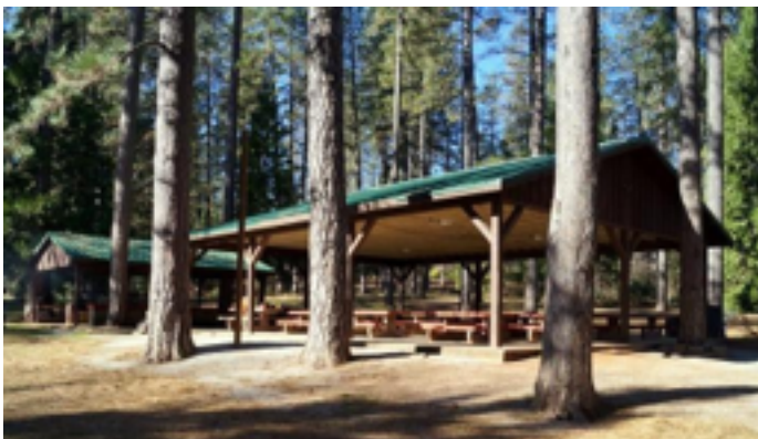
Summer Picnic will be here at Condon Park in Grass Valley. We might not need those EZ-Up's.