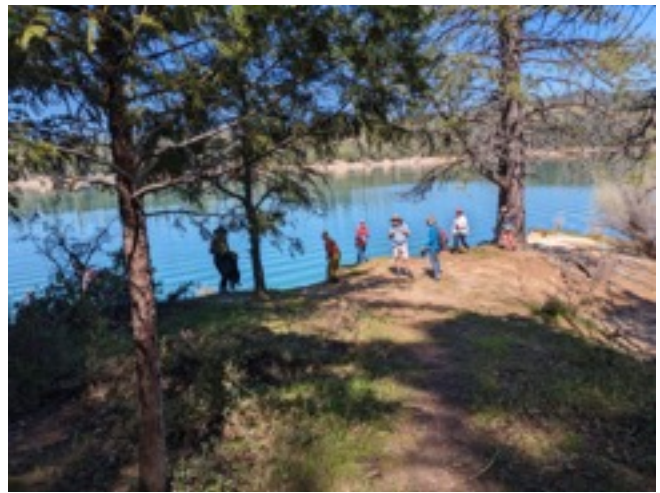
Those intrepid hikers at Bullards Bar Reservoir.