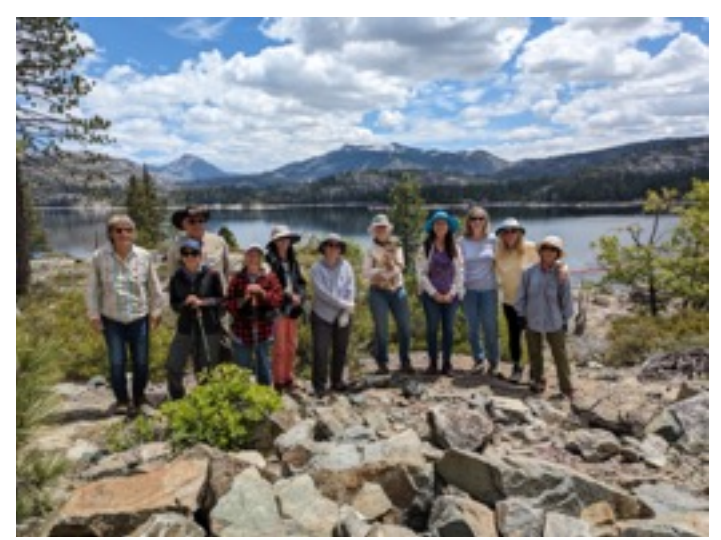
Lake Spaulding, 23May2024