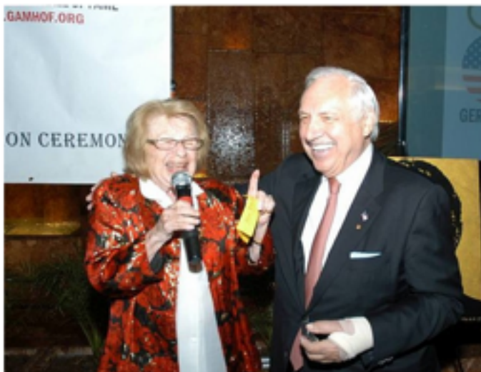
Dr. Ruth Westheimer at GAMHOF 2017 Ceremony

In 1980, just about the time when the Baby Boomers entered their sexually-active years, Westheimer's media career began with a call-in radio show from New York called Sexually Speaking . By 1983, the show had become the top rated show in the country's largest radio market. In 1985, she launched The Dr. Ruth Show on television, which attracted 2 million viewers per week. The New York Times reported that she had risen "from obscurity to almost instant stardom." She had come along at the right time to talk openly and candidly about sex and sexuality on the radio and television. She became known as "Grandma Freud" and answered questions seriously, while being funny, warm, cheerful, and respectful. She advocated sex, but not rape, not one night stands, and not pedophilia. She educated listeners about sexually-transmitted diseases, contraception, abortion when contraception fails, AIDS, and all sorts of formerly-taboo subjects of a sexual nature. She appeared on dozens of TV shows as a guest.