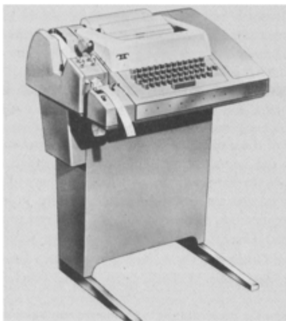
Teletype Corporation's new Model 33 Automatic Send-Receive Set

Edward Ernst Kleinschmidt was born in Bremen, Germany, in 1876 and immigrated to the United States with his family in 1884. During his career as an engineer, he was awarded 118 patents and was one of the principal inventors of what is known as the Teletype. The Teletype was the first practical device to transmit and receive text through telephone lines, and from the 1940's until the dawn of the computer age, it was used by newsrooms, the military, stock exchanges, police, and many businesses. In its day, at 100 words per minute, it was the fastest method of sending a printed message. Kleinschmidt's inventions in the early twentieth century involved making telegraphy faster and more reliable, and using paper tape to store telegraph messages as a series of punched holes in the tape. Similar paper tape is visible in the photo at left. Each letter character was represented as a coded pattern of holes, and over the years, those coded patterns evolved into the ASCII standard code used in serial communications today. So, USB and Ethernet use serial coding schemes that can be traced to the work of Edward Ernst Kleinschmidt.