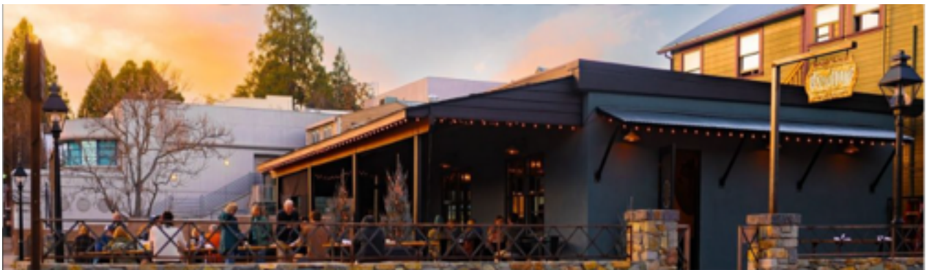
BrewBilt BrewHaus in Nevada City. Proposed shaded seating area is at right of photo.

What it is: Many of us came to the Stammtisch in Grass Valley last April. It was a royal hoot! We reserved a couple tables, enjoyed some micro-brewery beer and food items, chatted, and had a great time. We're going to spread the wealth and do the same at BrewHaus in Nevada City in August. This Stammtisch is planned for outdoor seating, on the east side of the brew house (in the shade). It will be balmy, according to extended forecasts. We plan to bring a large sign, visible to passers-by on Spring Street, announcing that we are the Gold Country German-American Club, and that we are "adjudicating" the beer at BrewBilt BrewHaus. The photo below is a view from the Spring Street side.