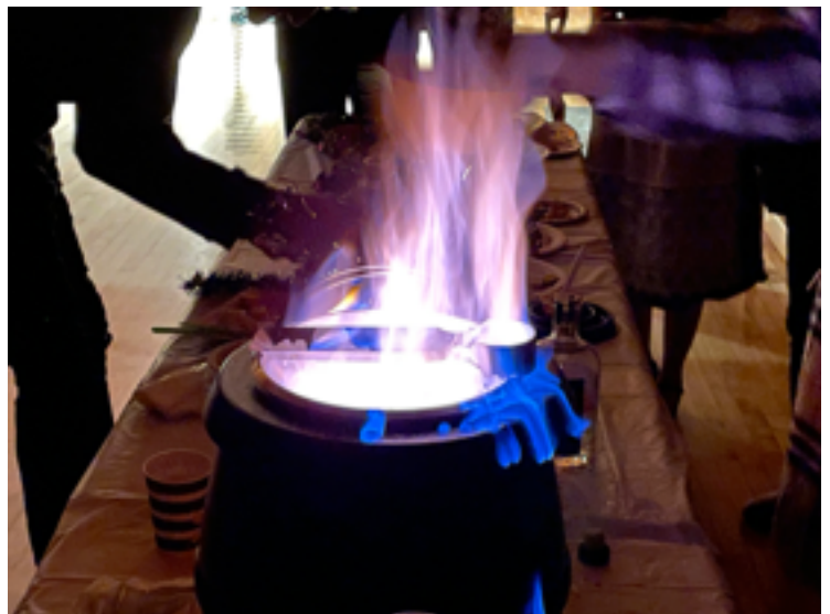
Feuerzangenbowle at Fasching! Fire water, indeed.