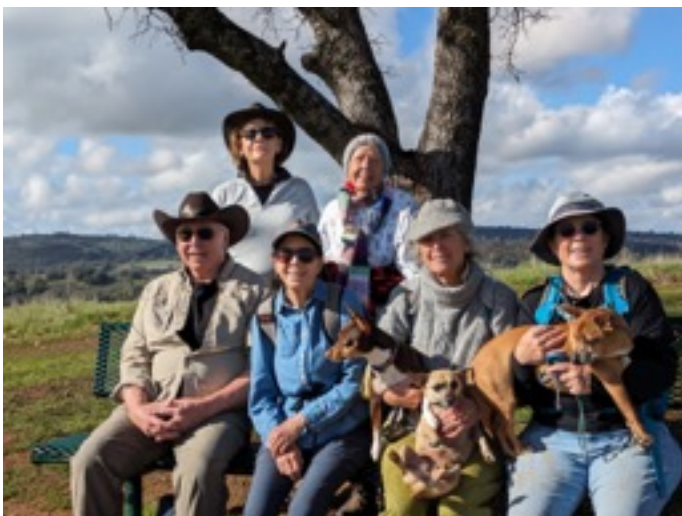
Happy Wanderers on the January 25 hike near Cronan Ranch. Full description next page.

Tune to KNCO Radio AM 830, weekdays at 7:50 a.m. to hear your birthday greeting from GCGAC!