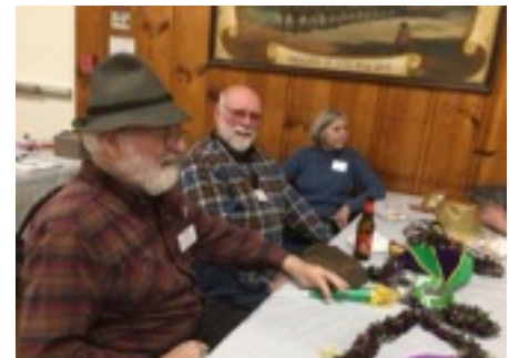
Photos illustrating our lively and friendly nature.