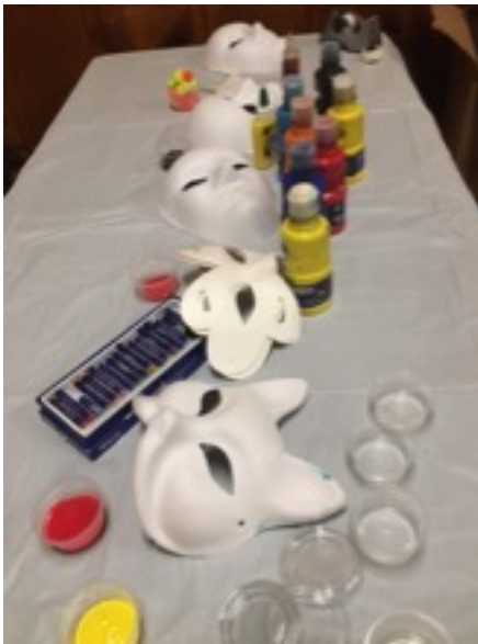
Arts and Crafts Department: Fasching masks ready to be painted.