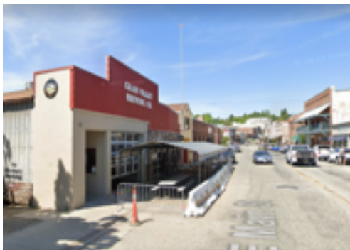
Grass Valley Brewing, outside (left) and inside (right). Lange Tische für Stammtisch!

Last year's Stammtisch , at Ribald Brewery, we had a great time and played cards provided by the proprietors. This year, we need to bring our own games. Do you have an Uno game? How about a German board game like Die Siedler von Catan , Germany's game of the year in 1995?