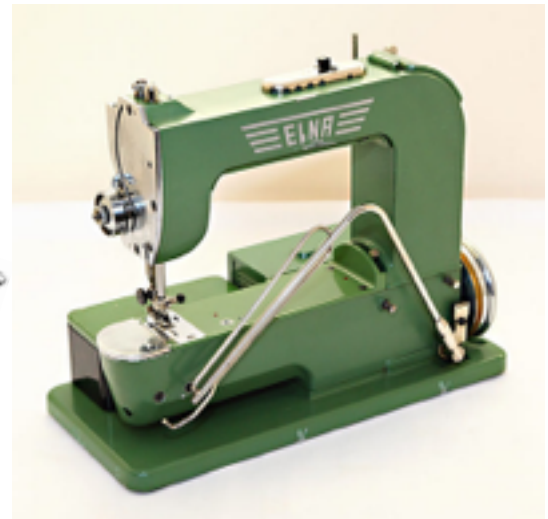
An ELNA "Grasshopper" Sewing Machine from the 1950's, made in Switzerland.