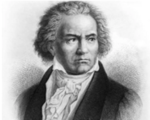
Ludwig van Beethoven