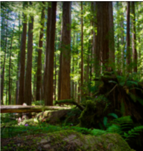
Redwoods National and State Park in Humboldt County