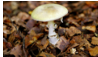
Amanita Phalloides mushroom, aka Death Cap. Do not eat.