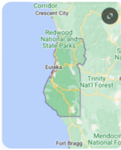
Humboldt County, California, surrounding Eureka