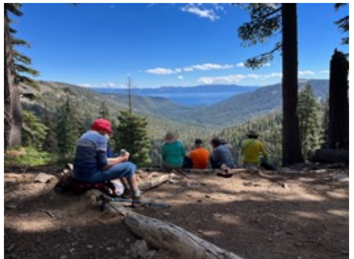
Enjoying the scenery during the lunch Pause .