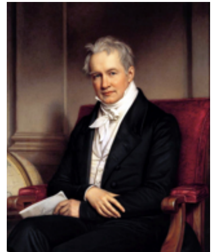
Baron Alexander von Humboldt, the namesake