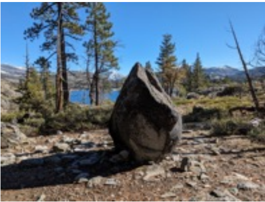
Interesting rock formation. How did it get there? By glacier?