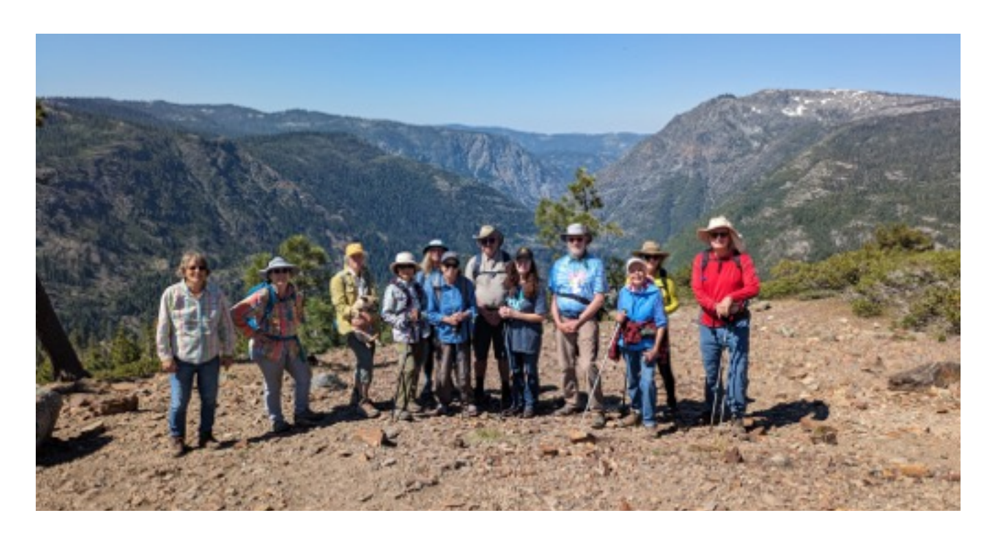
The Happy Wanderers at American River Canyon