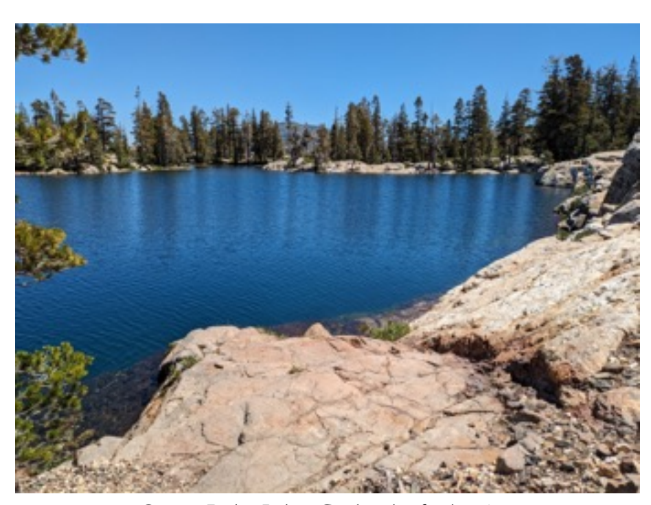
Grouse Ridge Lake. Cool and refreshing!

Again, the wildflowers appeared to be outdoing each other, and we felt so grateful to be able to walk among them.