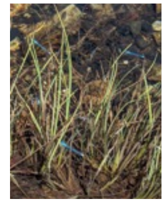
Damselflies in the grass. Can you see them?