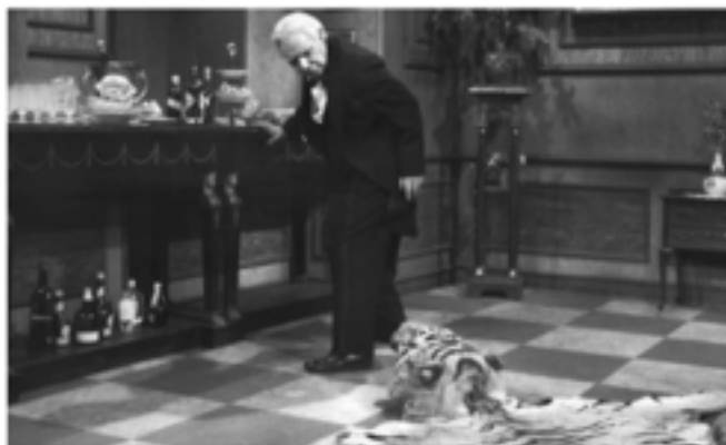
Dinner for One is watched by millions of Germans every New Year's Eve.

https://www.youtube.com/watch?v=2v8C9xYiu_I